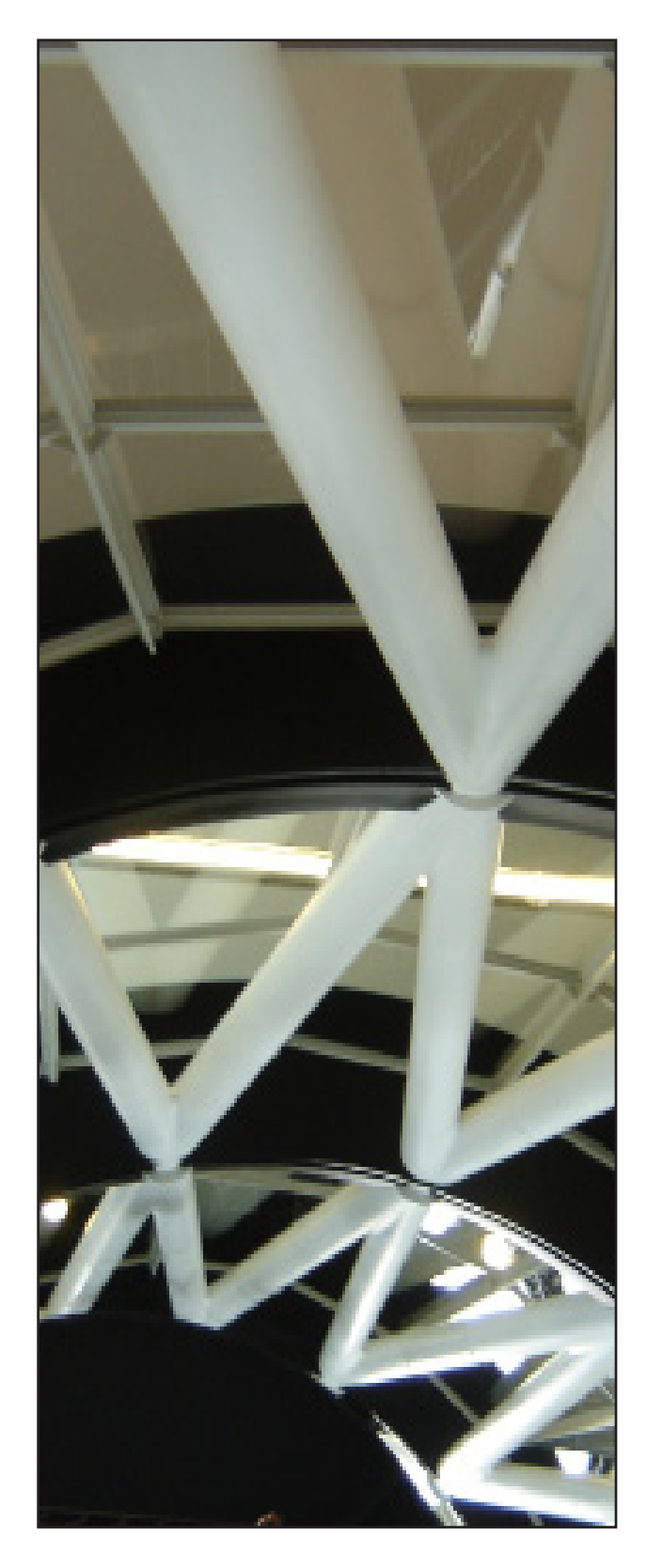
Fig. 4 Mediatech Library

During the Meiji Era with western culture came western fashion and architectural styles. In the case of Architecture, the style arrived before the technology necessary to build it. As a result, during the early Meiji period in the late 19<sup>th</sup> and early 20<sup>th</sup> centuries, western style architecture was built by craftsmen with the same wooden technology that had been used in Japan for centuries. It was not until western steel and masonry technology were fully adopted in Japan that the role of the traditional craftsman was substantially reduced. Just when it seemed that traditional crafts were in danger of becoming obsolete, circumstances surrounding the Second World War and shortages of modern materials helped to keep the influence of the craftsman vital well into the middle of the 20<sup>th</sup> century. Influential Architects of the time like Kunio Maekawa, Kazuo Shinohara