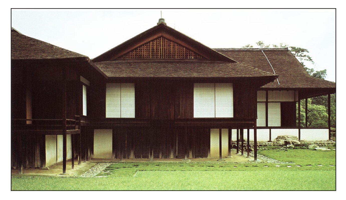
Fig.1 Katsura Detached Villa