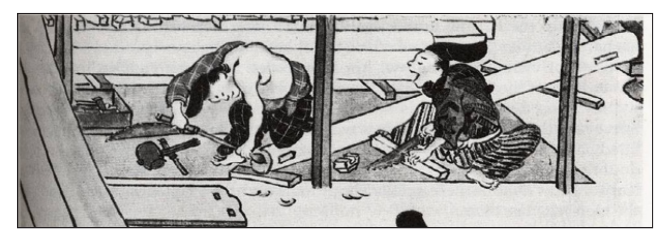
Fig.3 Carpenter's Apprentice

In all of the trades, craftsmen were subjected to a rigorous apprenticeship. Because they used tools from a very young age carpenters developed a high degree of manual dexterity and through years of immersion in the building process they developed an intuitive sense not only for their tools but also for materials, structure and proportion. It could be argued that more than any professional today Japanese carpenters were holistic building experts in the technology of the day. William Coaldrake writes in The Way of the Carpenter , " The carpen-