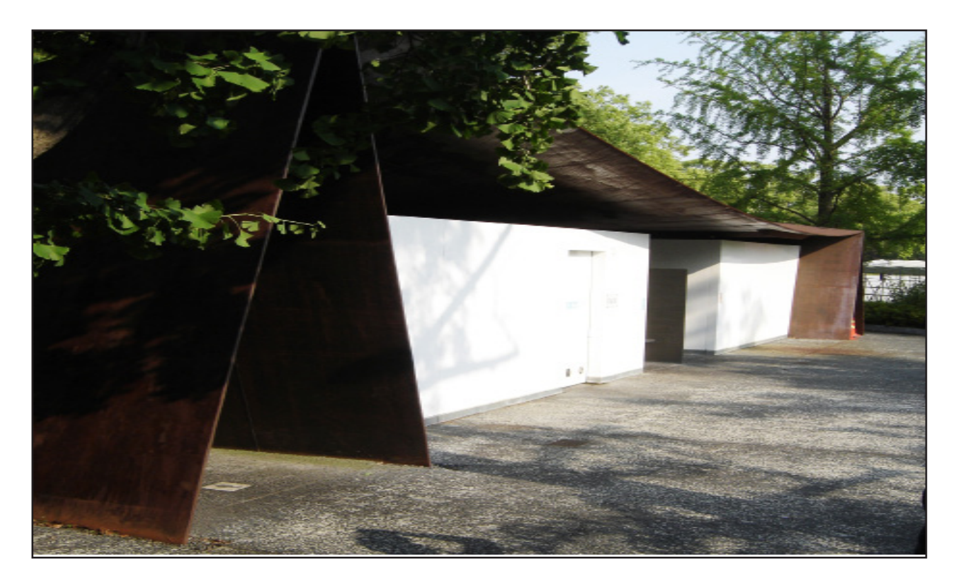
Fig. 5 Public Toilets

and Kiyoshi Seike were rediscovering the Japanese vernacular during this period and the work of the craftsman was once again in demand.